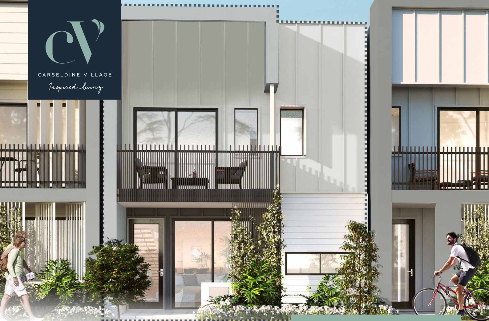
Different façade options available.