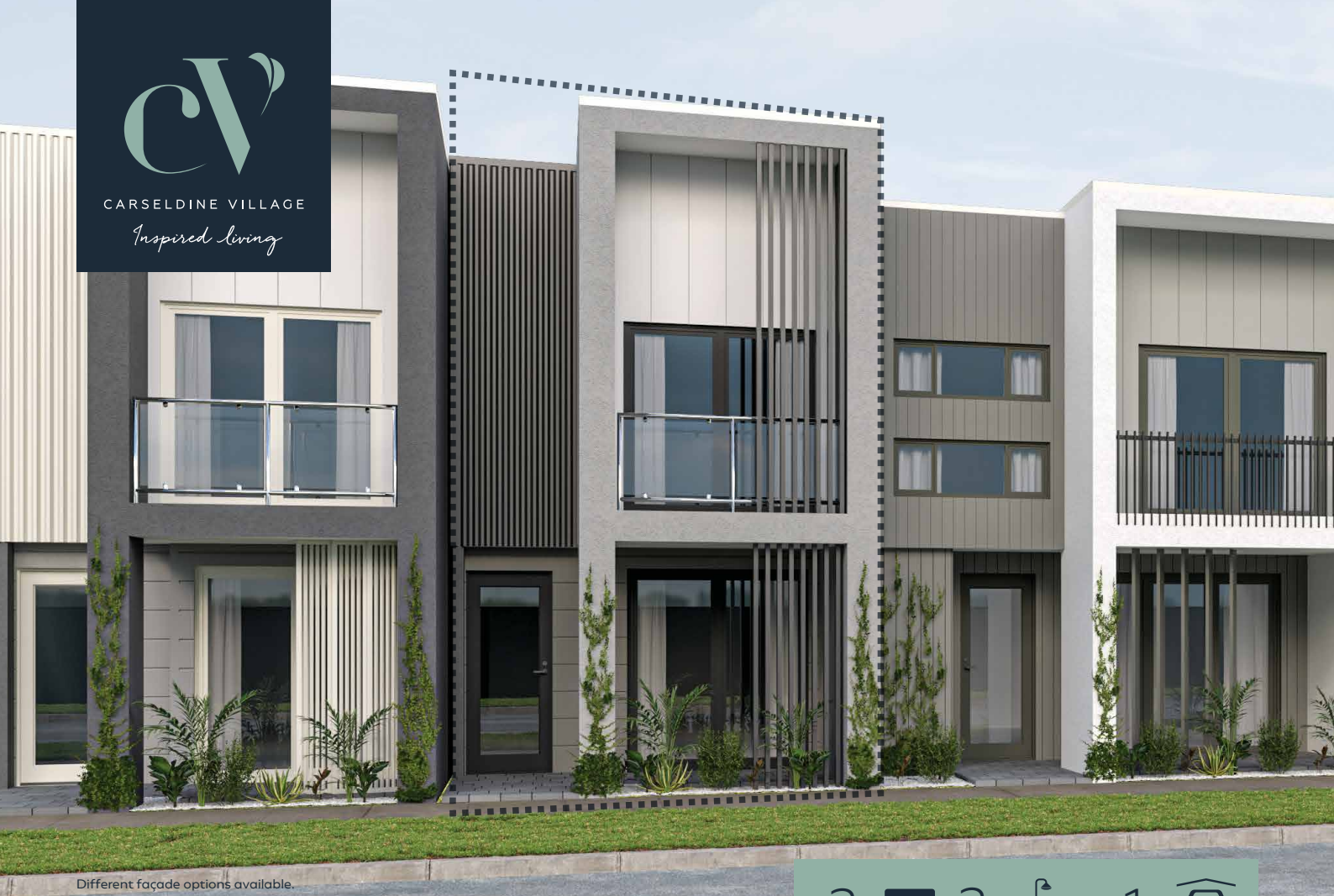
Different façade options available.